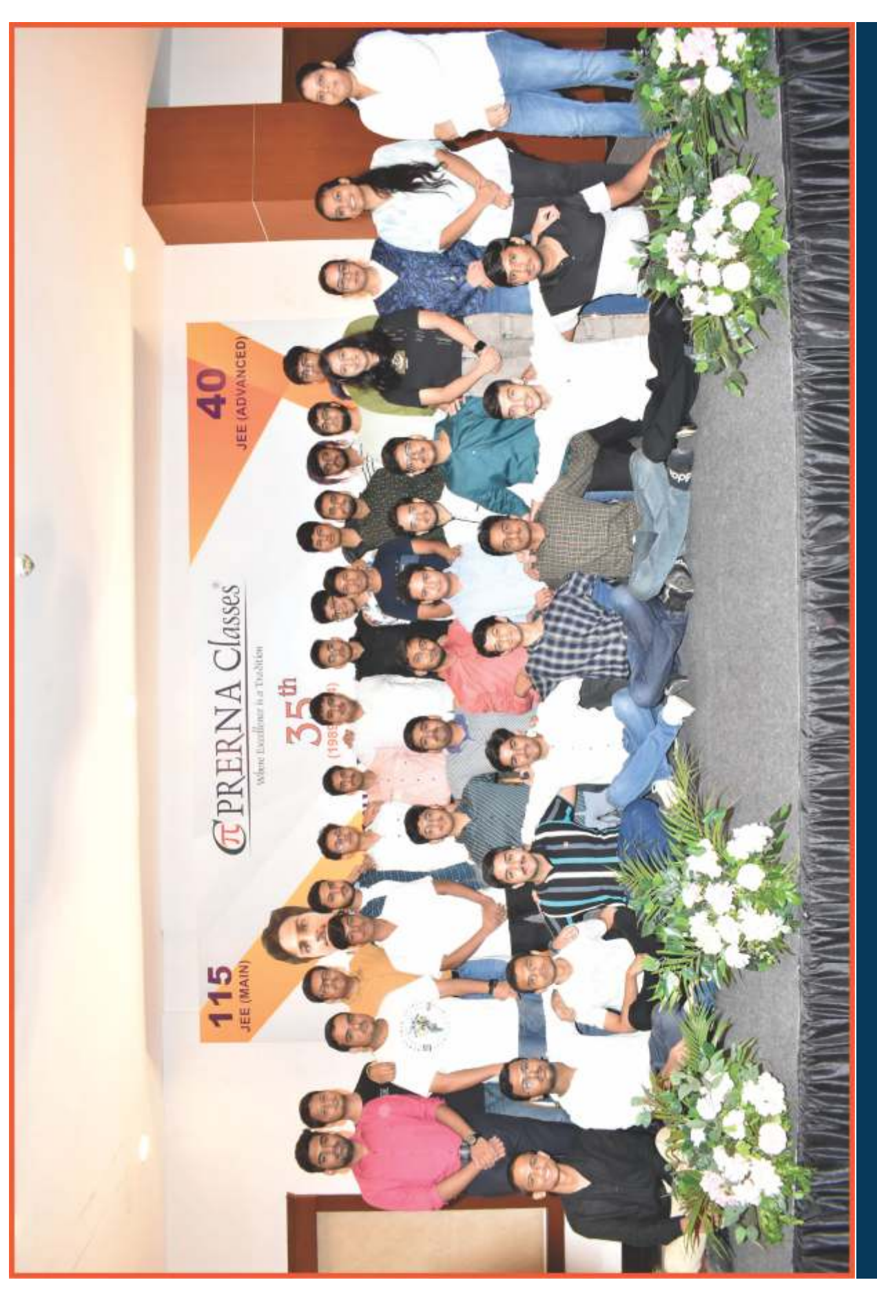
Successful Students of JEE (Advanced) 2024 at the Annual Felicitation Function on Sunday, 23<sup>rd</sup> June 2024 at Ramada Hotel, Jamshedpur.